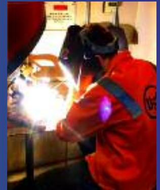
ICD Welding student during an in-class, hands-on exercise.

If a student needs training in computer basics, it can be provided through Career Development.